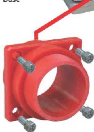
4" Threaded Male Wear Adapter 41-31812-M