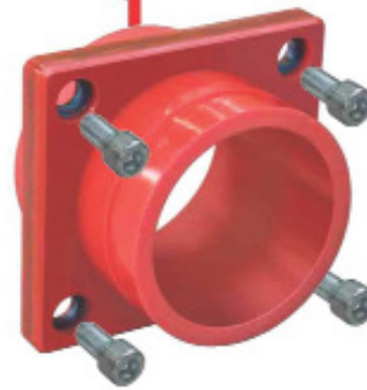
4" Victaulic Wear Adapter 41-31812-V

Interchangeable Wear Adapters (SOLD SEPARATELY)