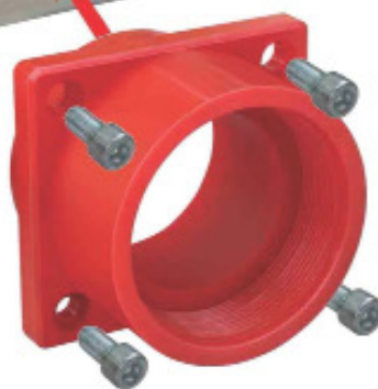
4" Threaded Female Wear Adapter 41-31812-F